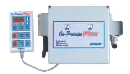
1 and 2 Product Liquid and Solid Laundry Chemical Dispenser

The On-Premise Plus is the laundry industries most feature packed and adaptable dispenser for laundry machines in the 35 lb. - 175 lb. category. The multiple formula remote control provides 8 user selectable wash formulas for dosing a variety of laundry soils. The "OPP" includes a low voltage Washer Interface Module that connects directly to the washers and triggers the dispenser to deliver chemical at the correct interval. This versatile system adapts to the need of your customers. With over 10,000 systems installed around the globe, the On-Premise Plus is proven technology you can rely on!