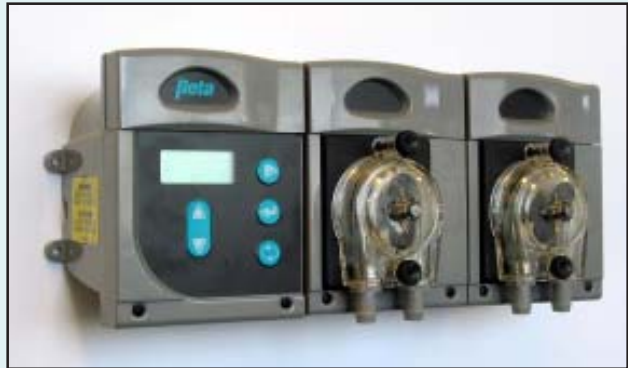
A water solenoid and third pump for sanitizer are available on order, and can also be field installed.

Sierra logs account management information that can be used to analyze