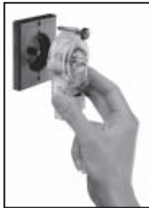
Beta SnapHead™ Pump