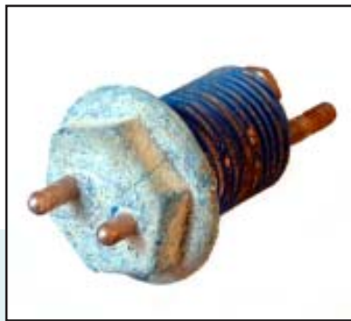
VCP enables dirty probes to perform as if clean.

Getting superior results means ensuring chemical is properly dispensed. Sierra ensures premium performance with visual and audible alarms. The sonic alarm alerts the operator there is a problem, while the display gives troubleshooting information. For example, the low detergent alarm tells the operator there is not enough chemical in the wash tank. The most common cause of this alarm is an out-of-detergent condition, so the display commands the operator to "Add Detergent".