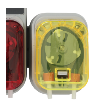
Available for Pinnacle and Pinnacle Pro