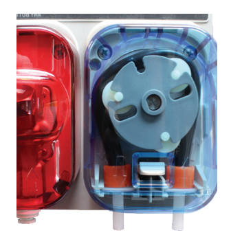
Pinnacle Pro: For higher volume installations