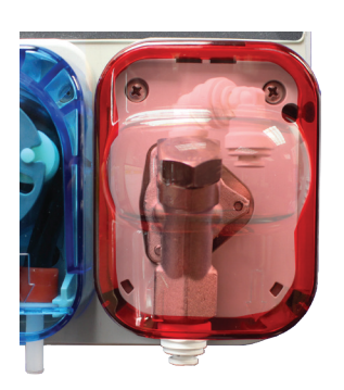
Available for Pinnacle and Pinnacle Pro