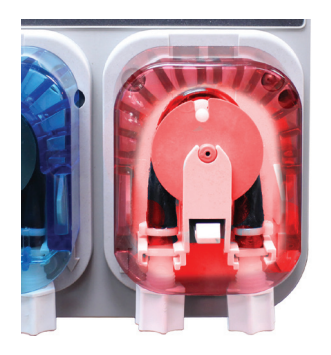
Pinnacle: For more economical inatallations